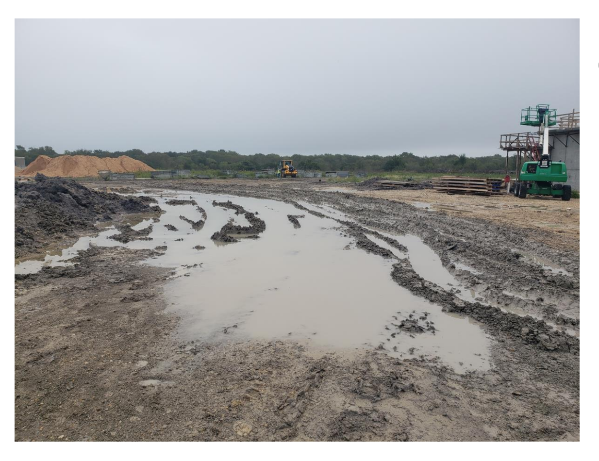
October 15, 2021