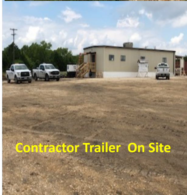
Contractor Trailer On Site