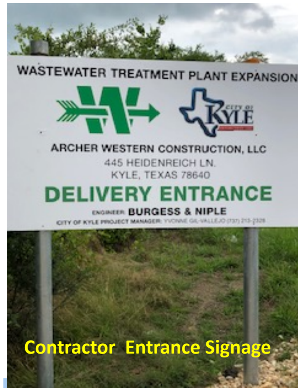
Contractor Entrance Signage