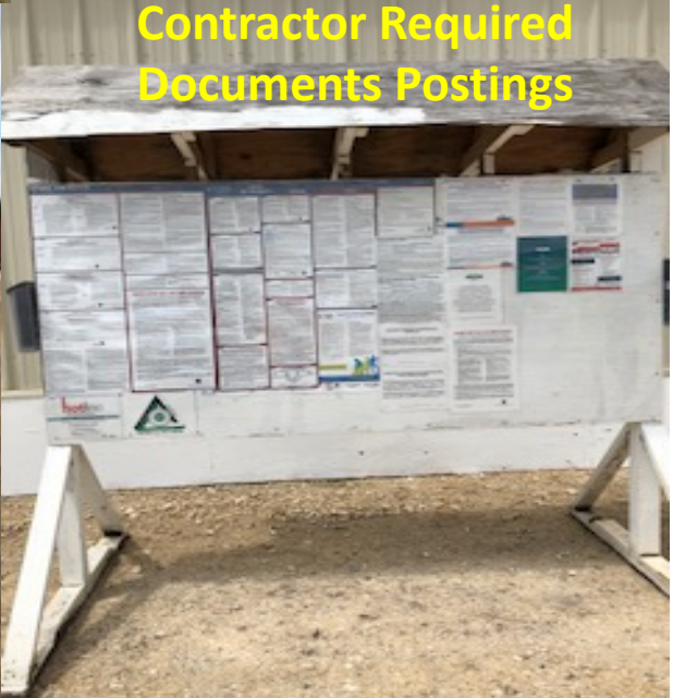
Contractor Required Documents Postings