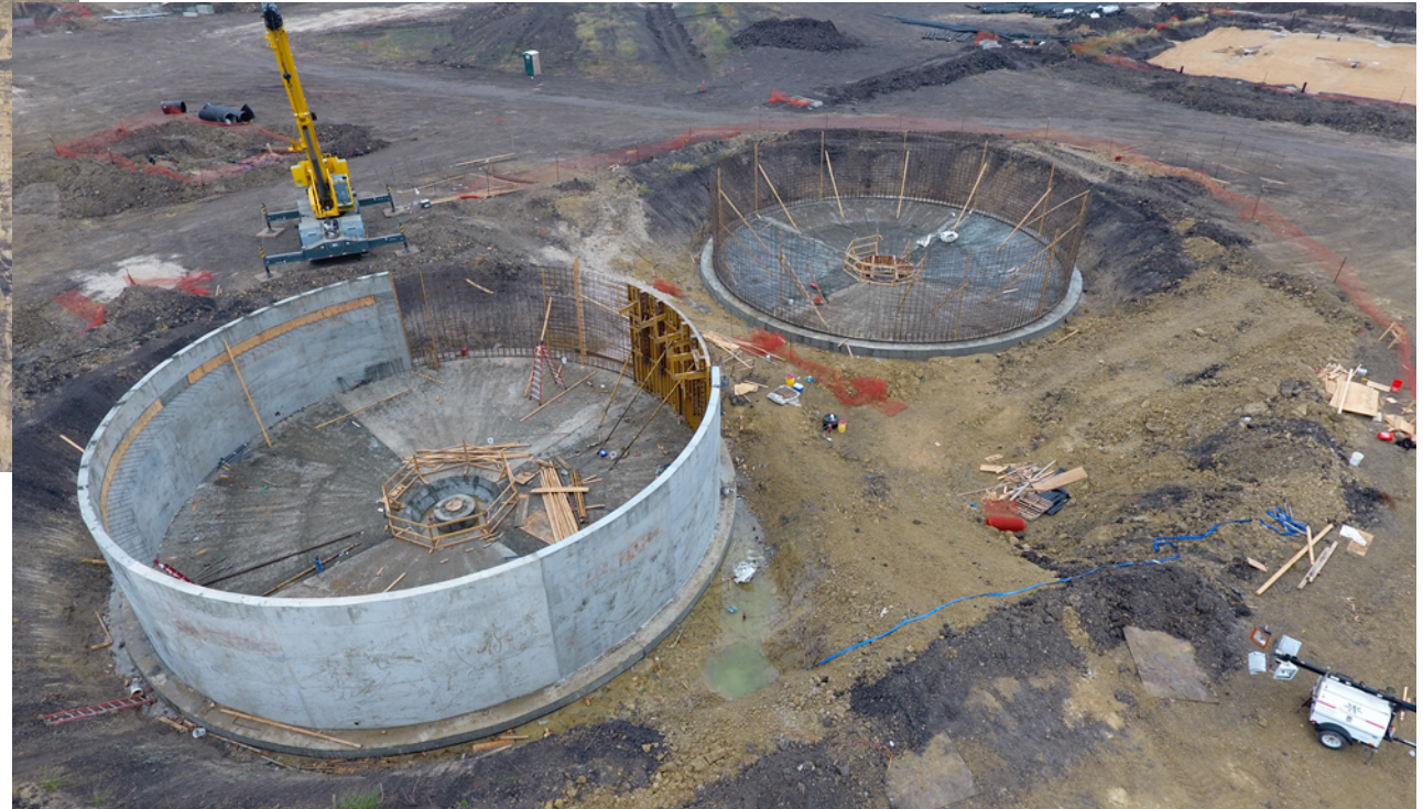
Clarifiers 1A & 1B