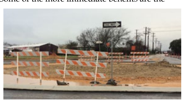
Roundabouts have benefits over signs and lights at intersections.

Some of the more immediate benefits are the