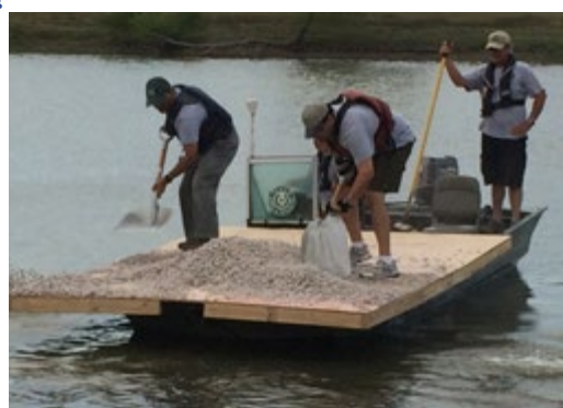
TPWD put 80 tons of rock in Lake Kyle, creating a spawning area for sunfish.

A: Those rocks create an enhanced habitat area for spawning - that's where fish lay their eggs. The rocks, which are near the shoreline, create sites for sunfish nesting colonies.