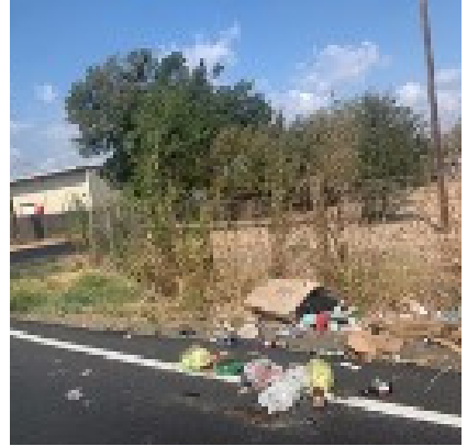
Old Post Rd & CR 158