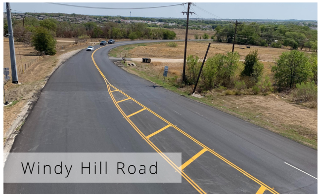
Windy Hill Road