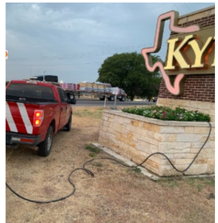
City of Kyle Signs