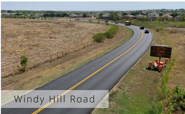
Windy Hill Road