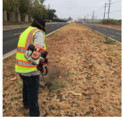
Kohlers Crossing mowing and pick up