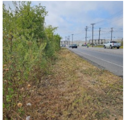
Kyle Crossing Mowing and litter pick up