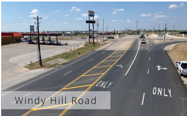
Windy Hill Road

Striping has been completed for the Windy Hill Road Overlay Project. This project was started on August 23, 2023. Street Construction crews overlaid approximately 2,150 linear feet of roadway from I-35 Frontage Road to near Cherrywood Road to repair surface road failures due to wear & safety concerns. Public Works staff also completed the new crosswalk, striping, ADA ramp, and short sidewalk extension at the Kohlers & 2770 intersection. This work was performed in-house by our Street Maintenance Department.