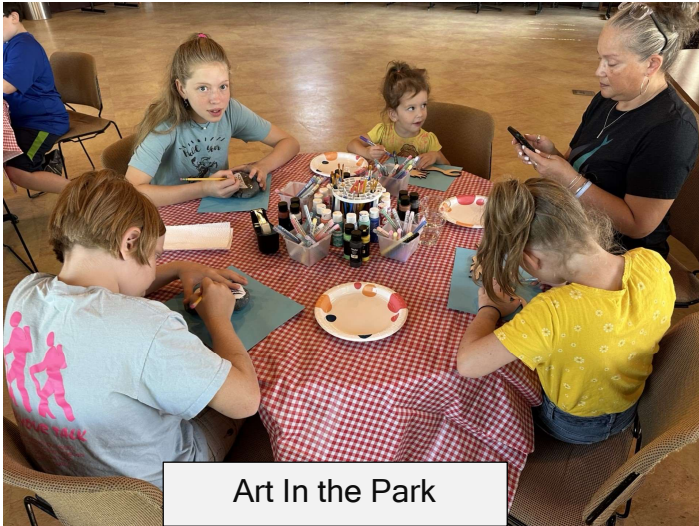
Art In the Park

When the lake fills back up, fishing can resume at Lake Kyle. Irrigation and seeding to begin. The estimated total completion time frame is August.