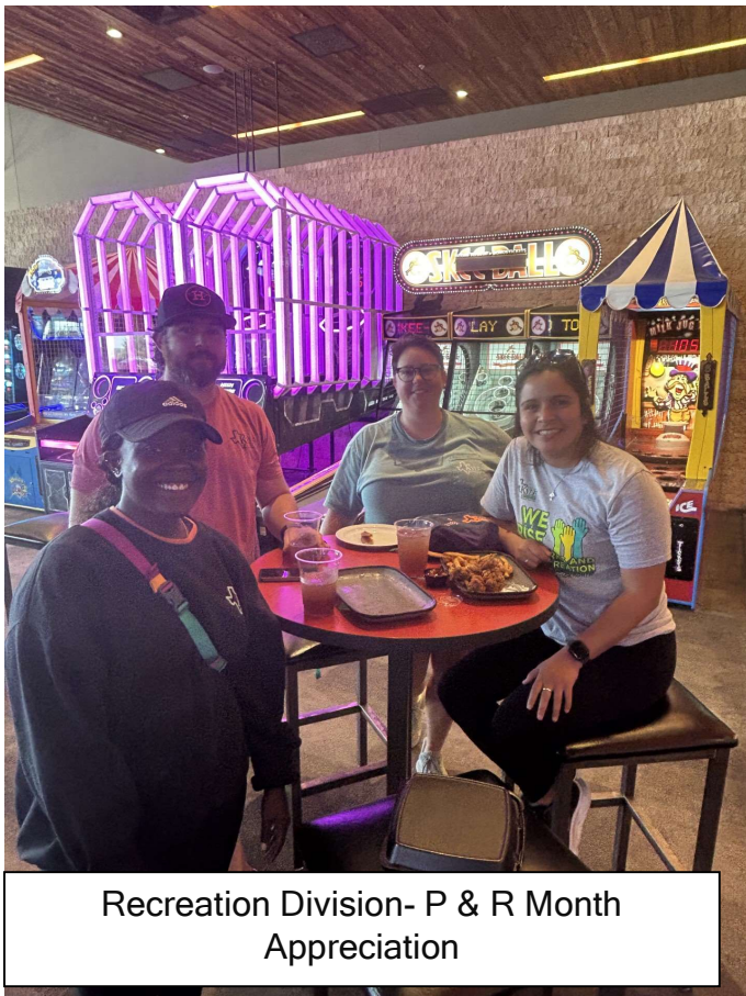
Recreation Division- P & R Month Appreciation