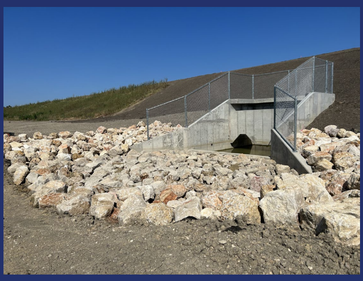
Fishing will resume at Lake Kyle Park as the Lake refills with water.