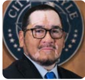
Mayor Pro Tem District 2 Robert Rizo