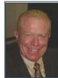
Ben Barnes Former Lieutenant Governor of Texas; Founder/CEO, The Ben Barnes Group

Space is limited - RSVP Today dcvisit@austinchamber.com