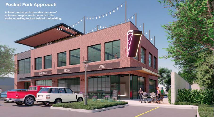
Pocket Park Approach

The design of the building emphasizes the street experience. The building creates a strong and active edge along the square, while pushing back from the property line to open up a wide sidewalk where the life of the building can spill out.