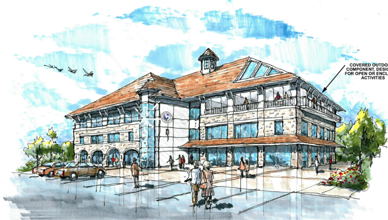
DESIGN CONCEPT - TRADITIONAL