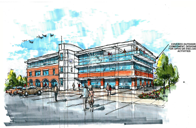
DESIGN CONCEPT - MODERN

107 HAMPSHIRE LN., STE 105 RICHARDSON, TX 75080 PHONE: 214.388.2125 PROJECT# 200 DATE: 01.12.2020