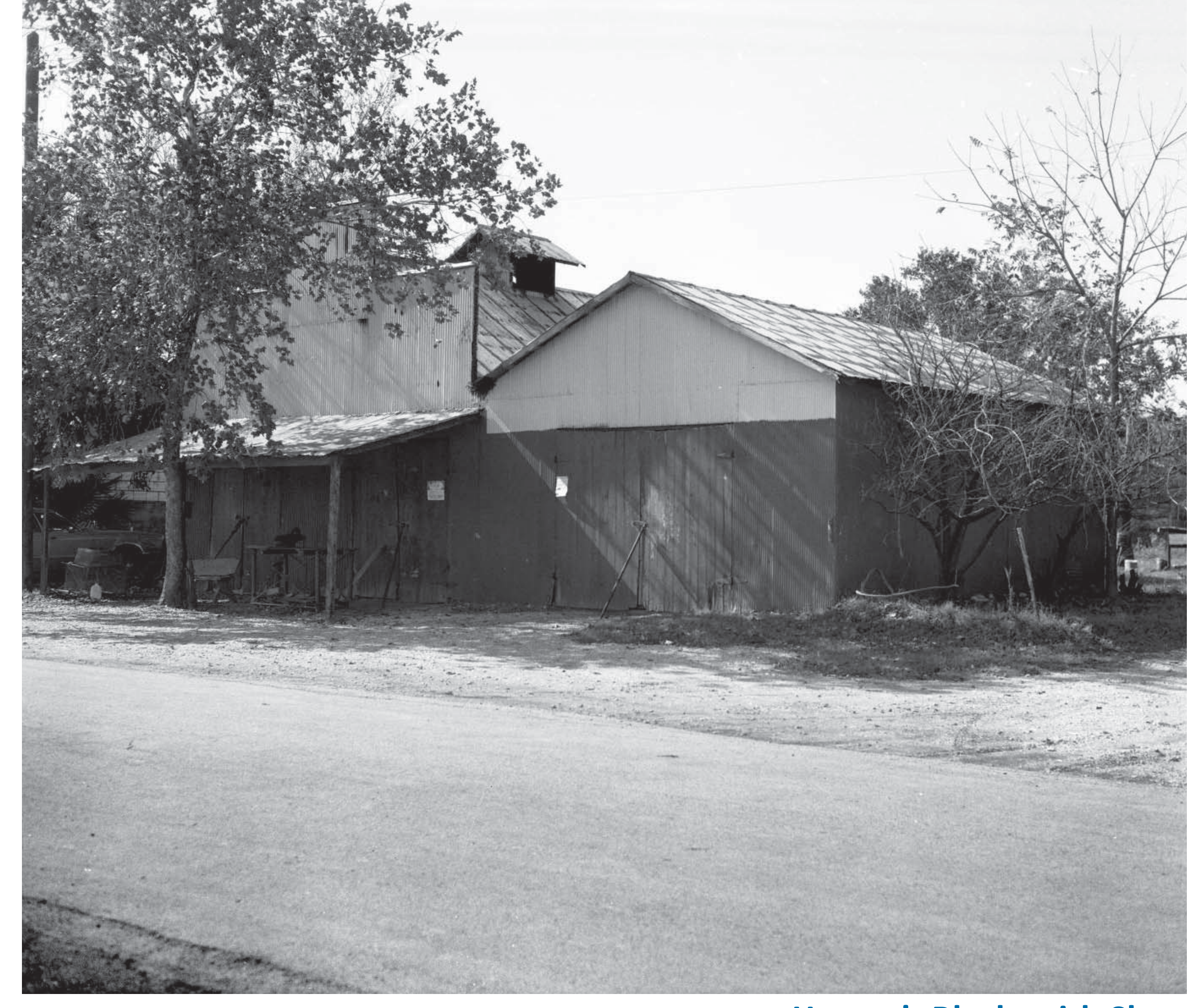
Herzog's Blacksmith Shop