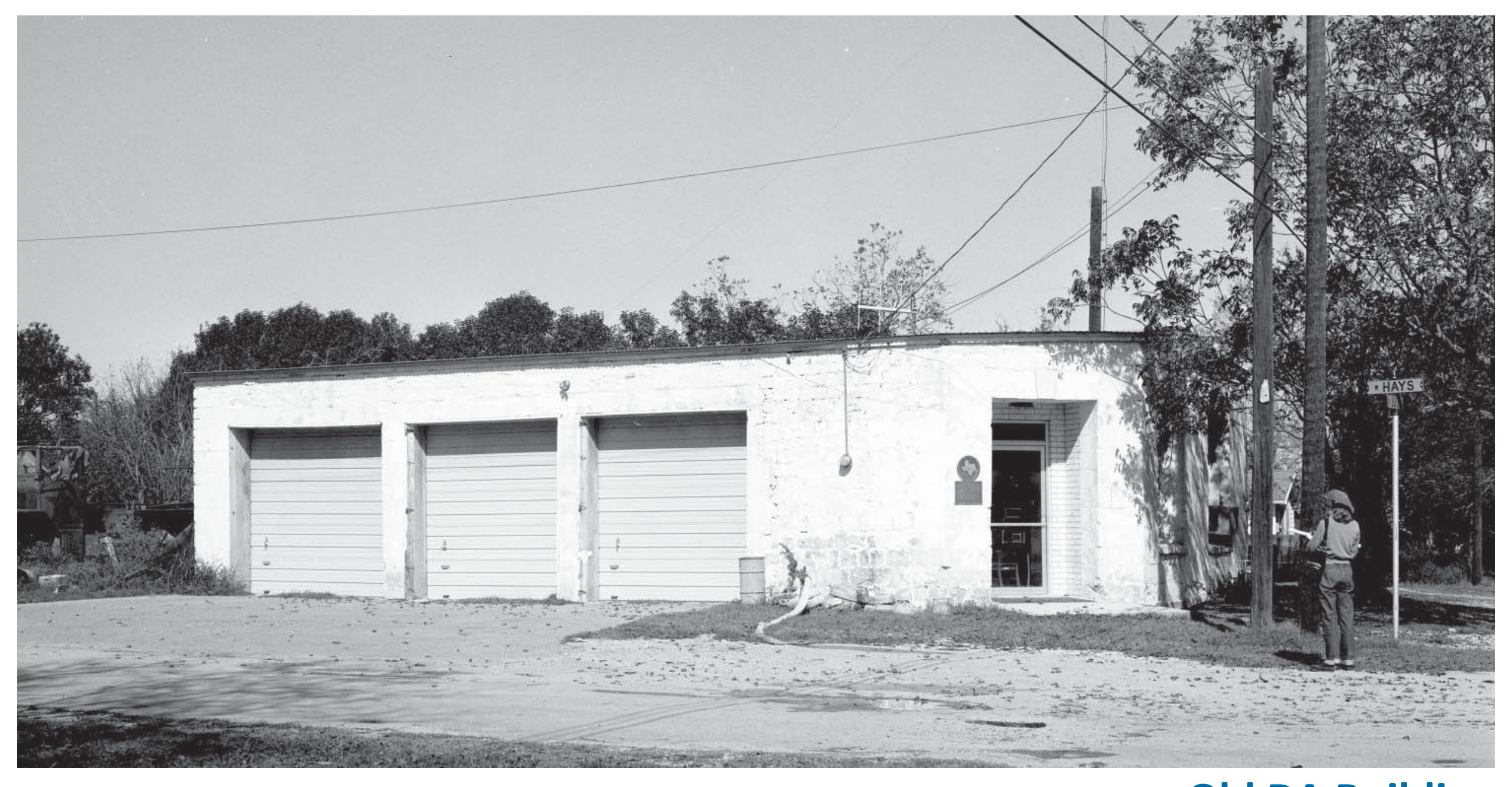
Old DA Building