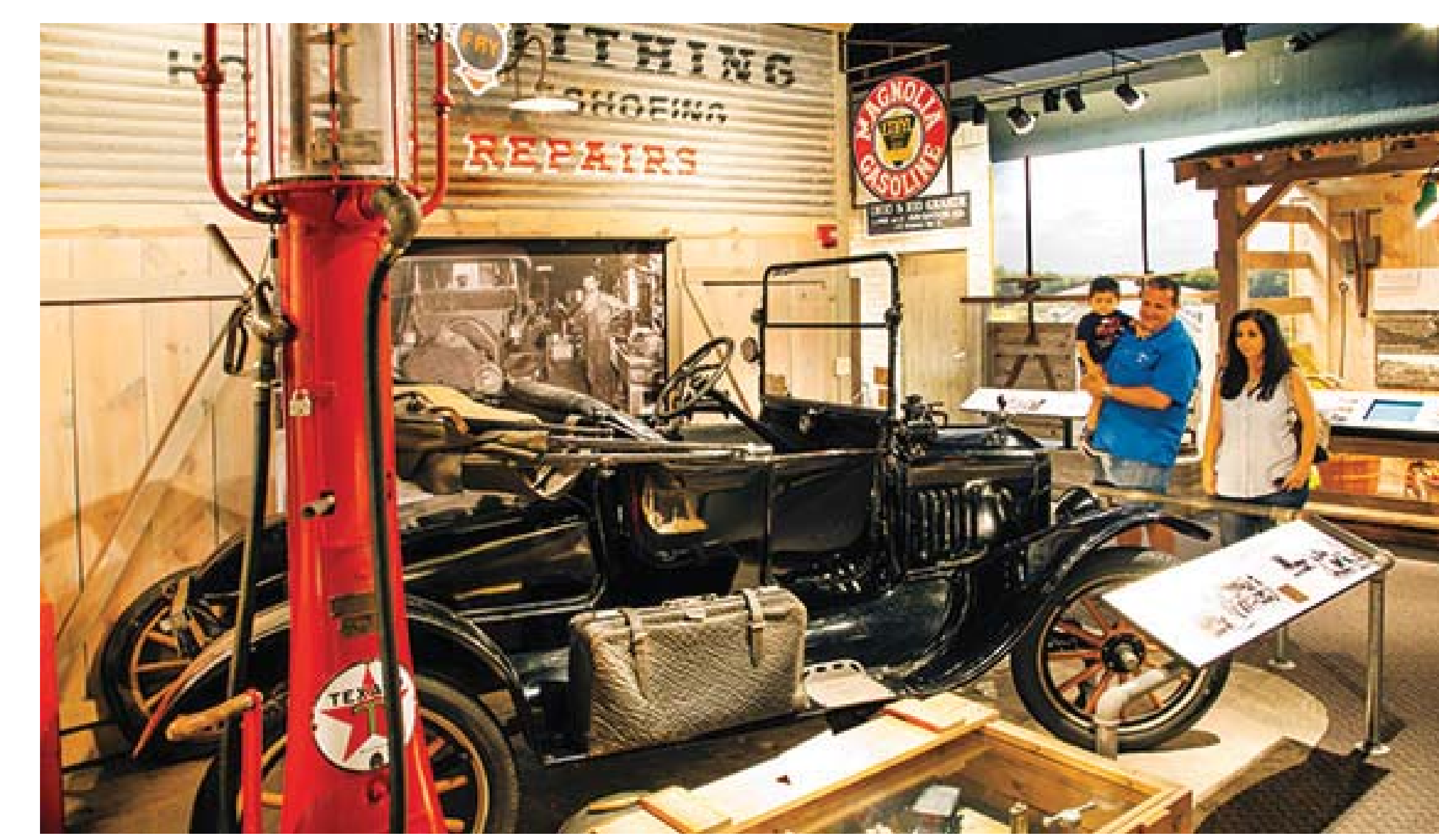
Cultural & Historical Spaces