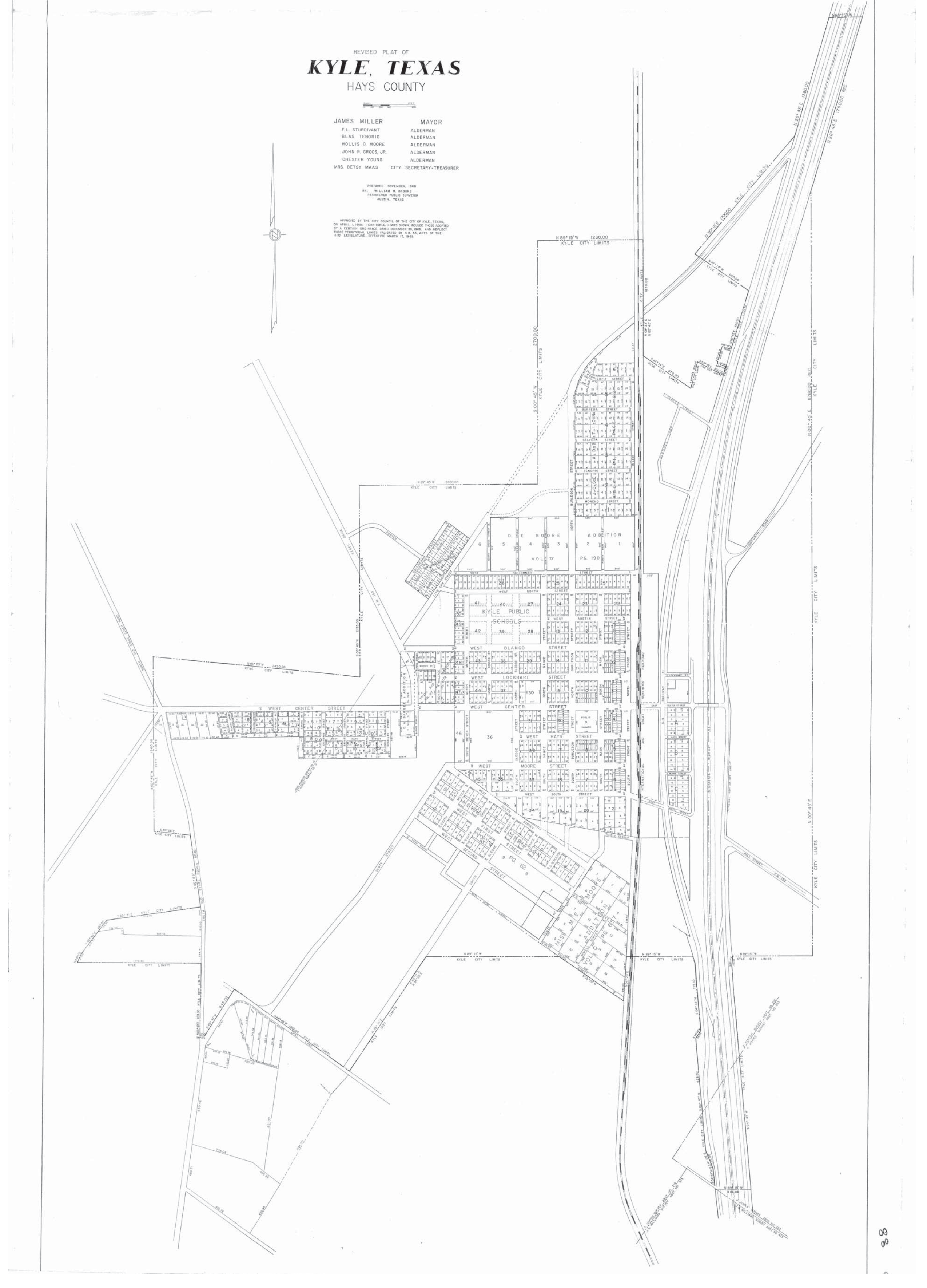
City Map of Kyle, 1968