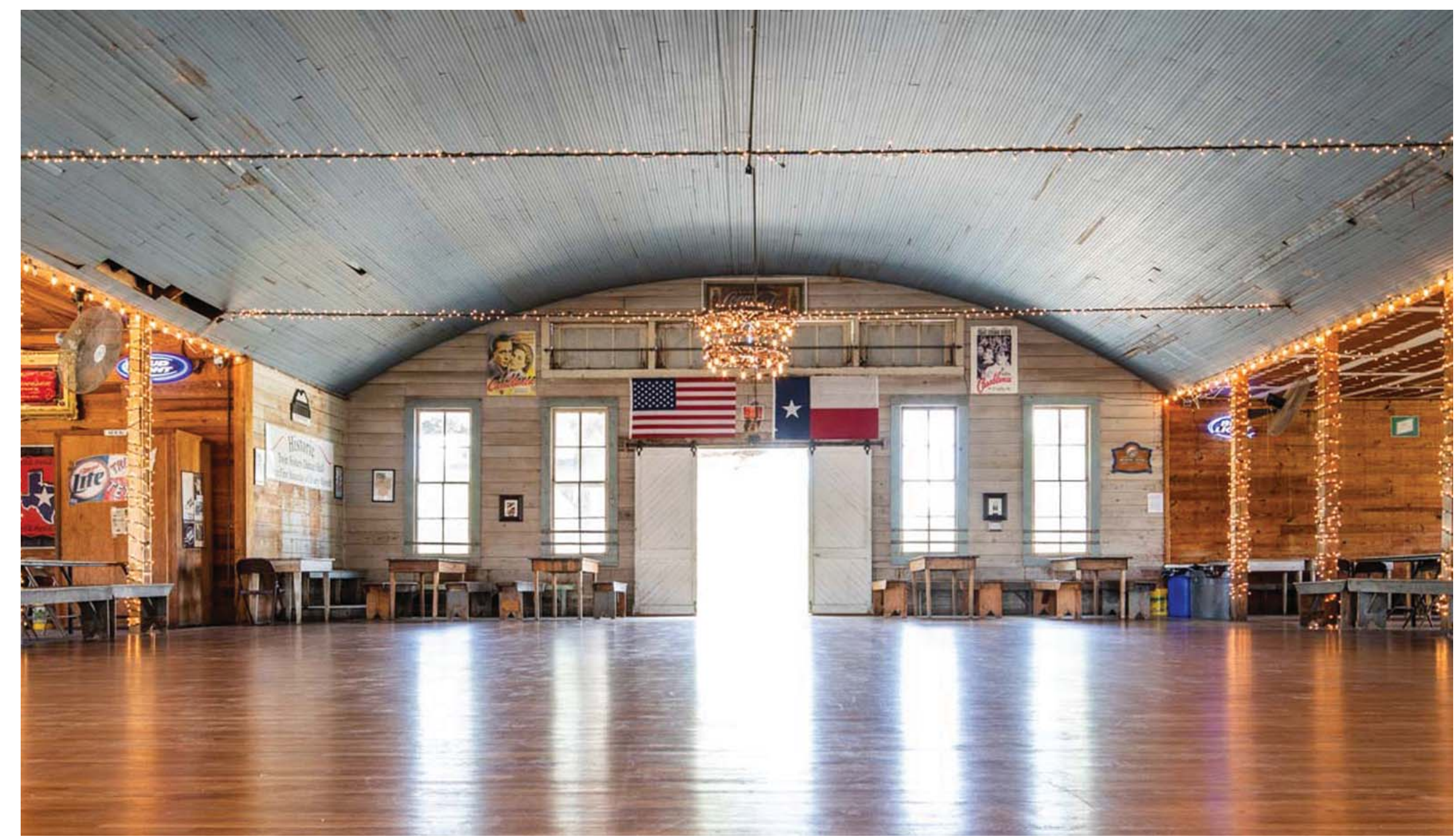
Dance Hall and Event Space