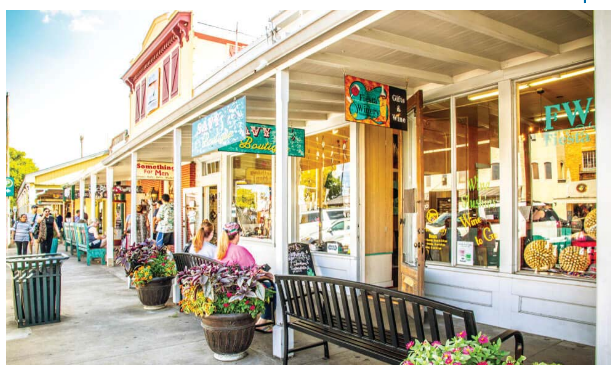
Stores and Places to Shop