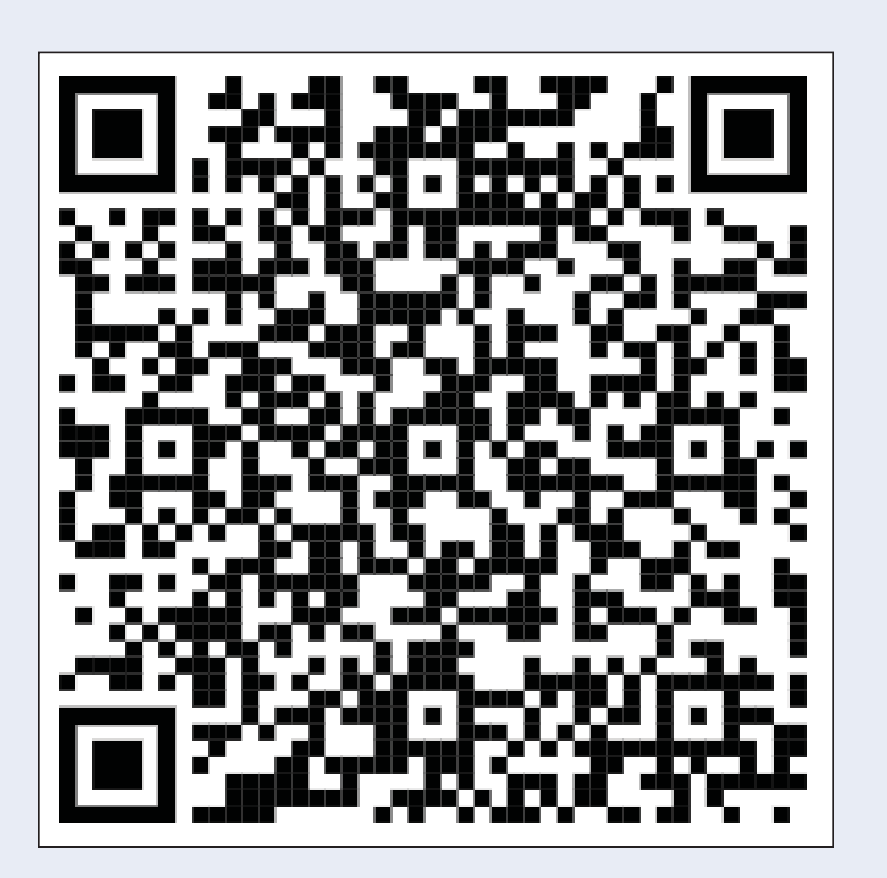
Architect & Planner Barnes Gromatzky Kosarek Architects

Please take this 5 min. survey to share your thoughts on the Downtown Master Plan. Thank you!