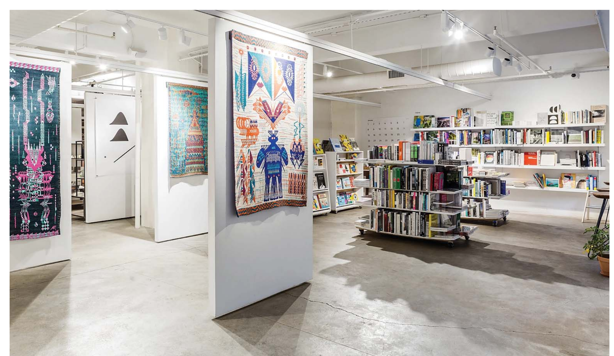
Art and Exhibits