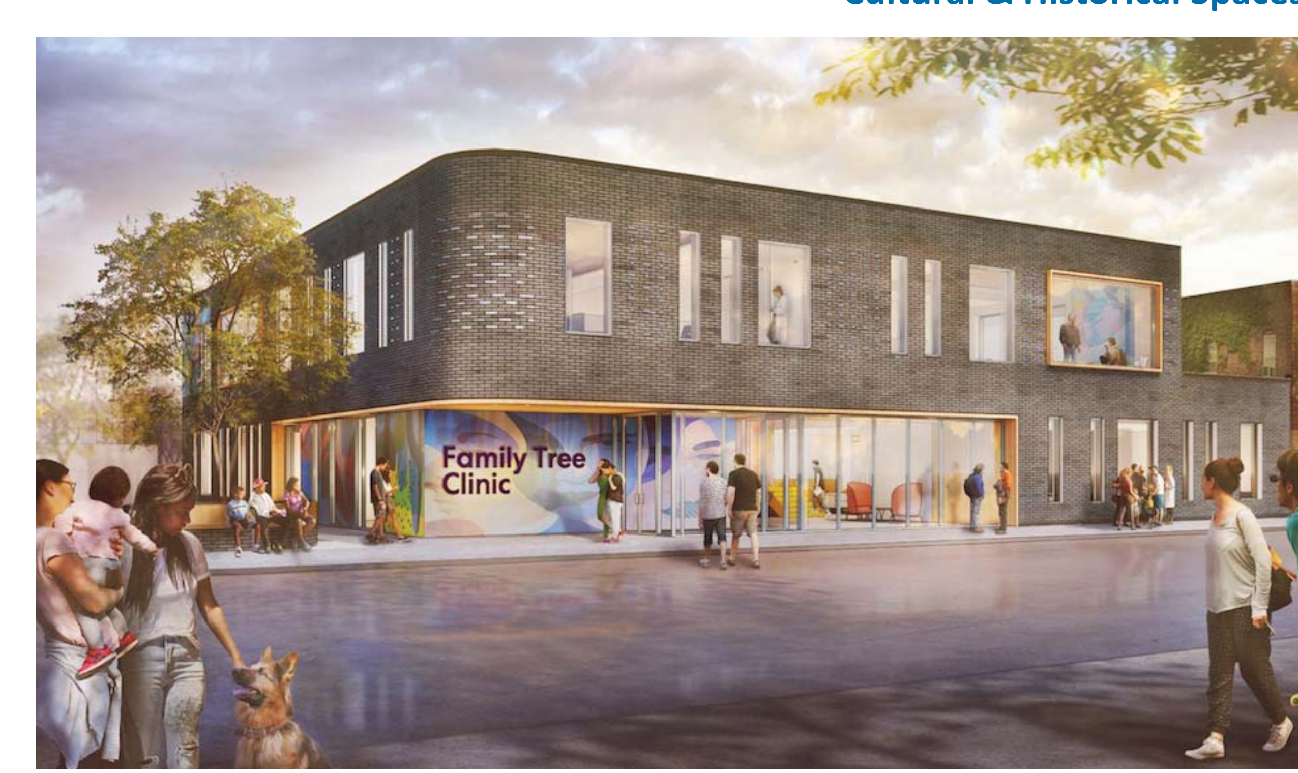
Health and Wellness Clinic