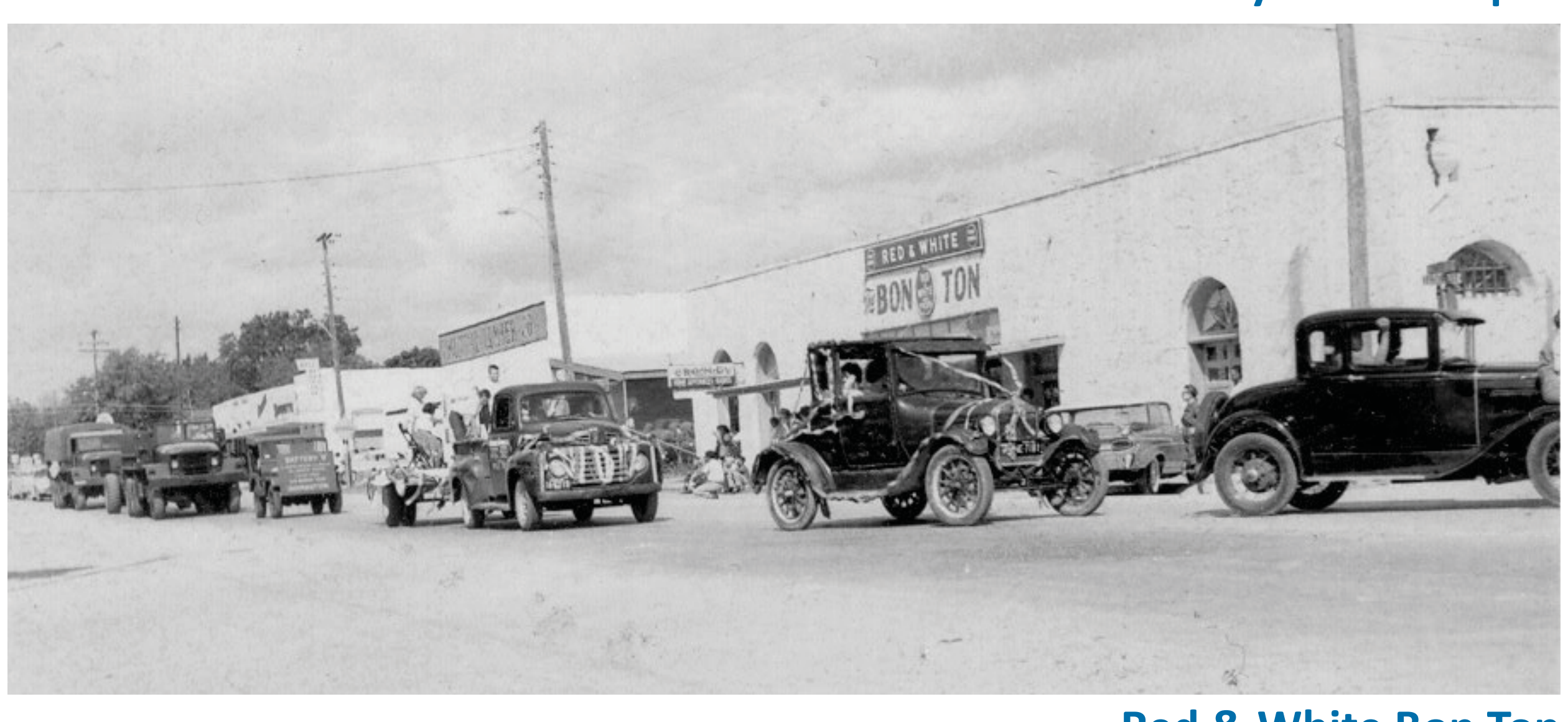
Red & White Bon Ton