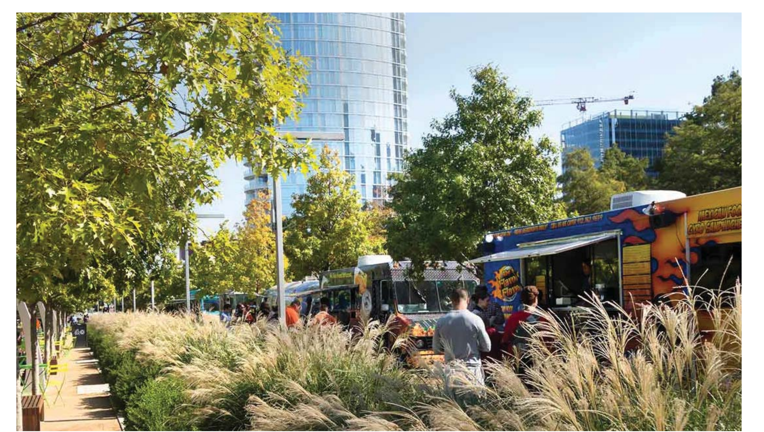
Outdoor Dining and Food Trucks