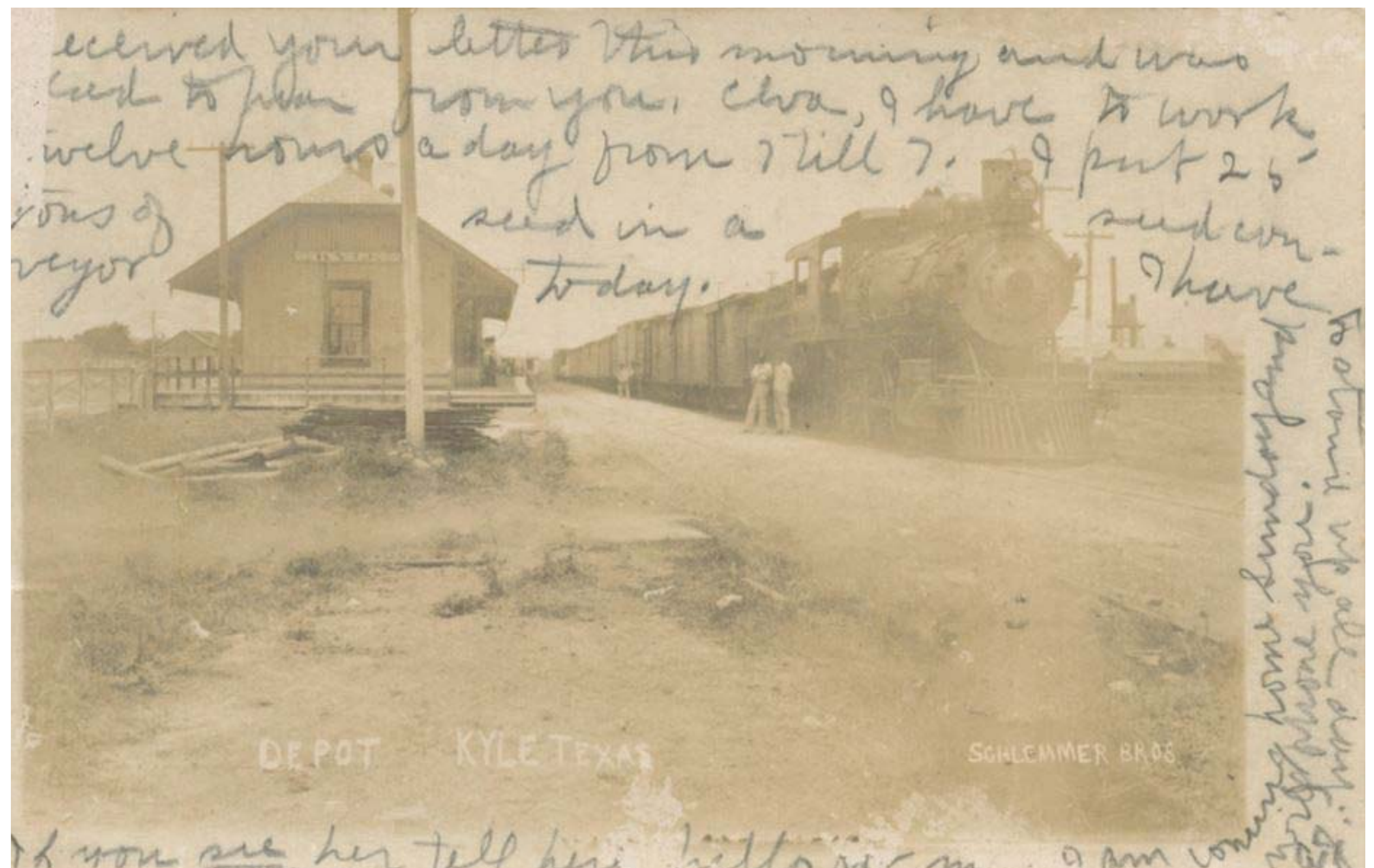
Kyle Train Depot