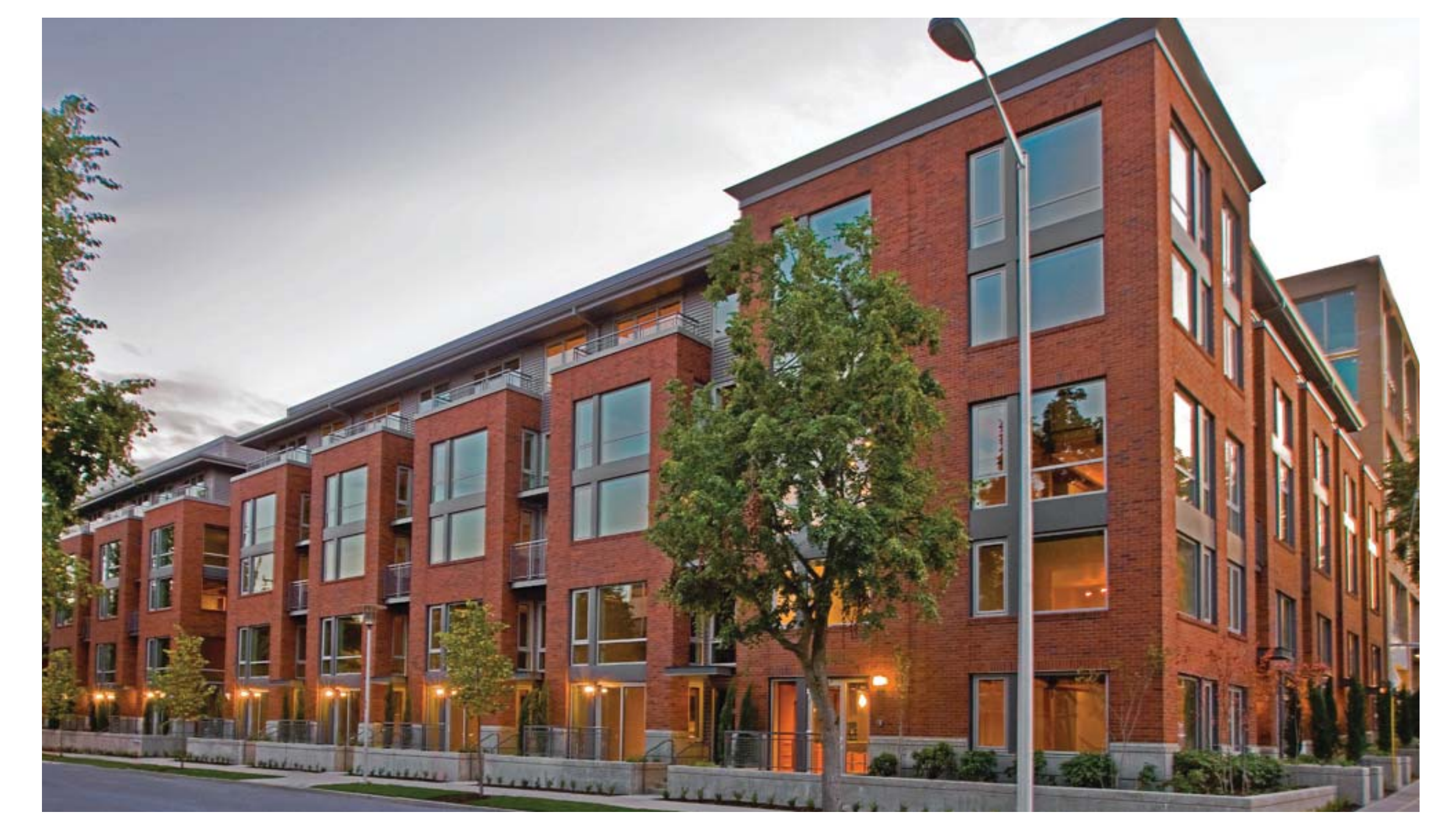
Apartments and Townhomes