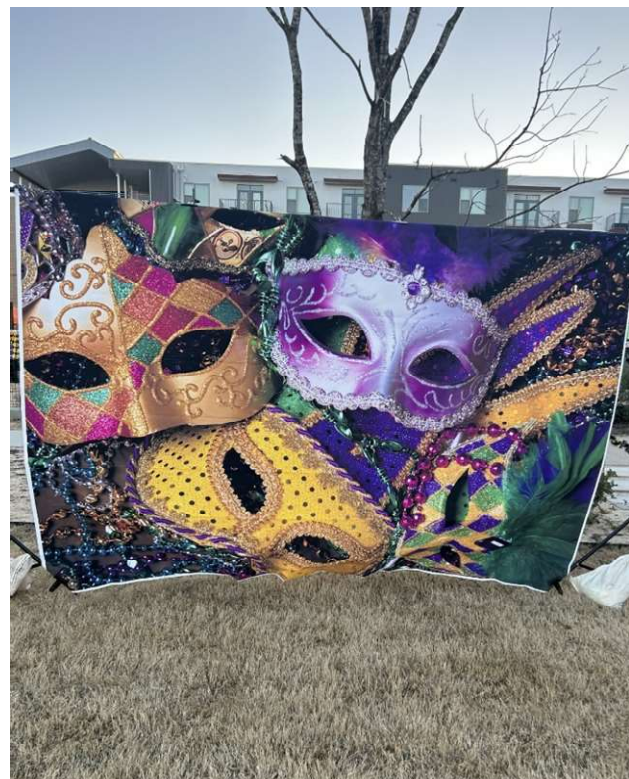
La Verde Park Mard Gras Event Photo Opportunities created by staff